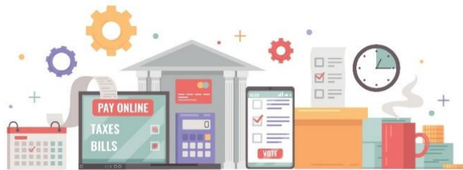
ONLINE PUBLIC SERVICES

可否以電子方式繳交新供水申請的費用？ Is it possible to pay the fee for a new water connection through electronic payment methods?